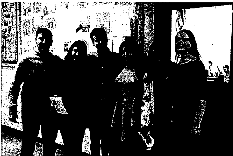
Graduating HASP Seniors