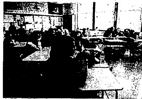
A H.A.S.P. class in session.